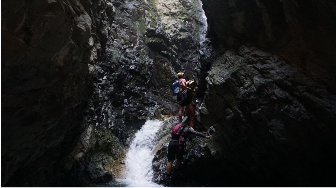
A waterfall hike on the way to the Sand Dunes