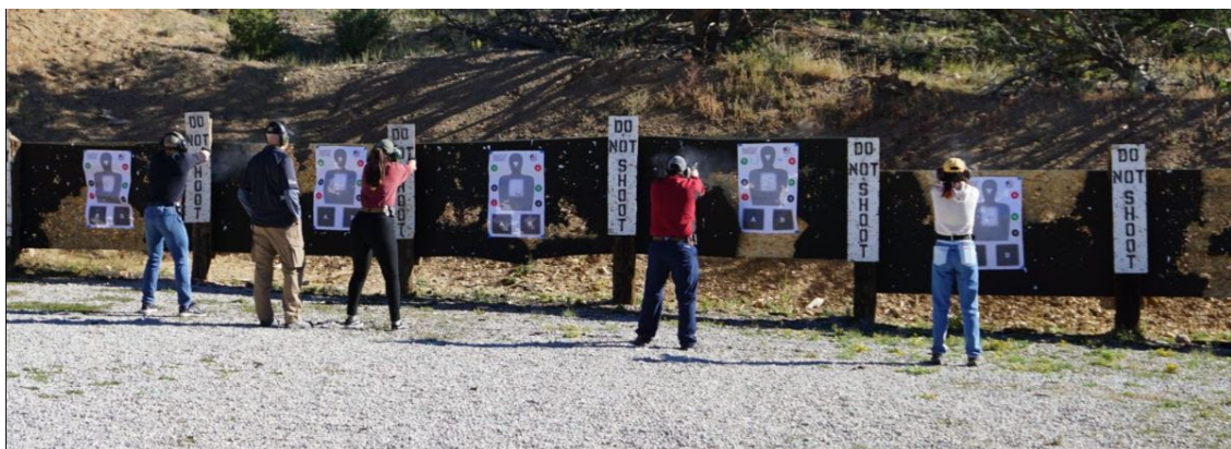
Defensive Shooting Fundamentals "field trip"