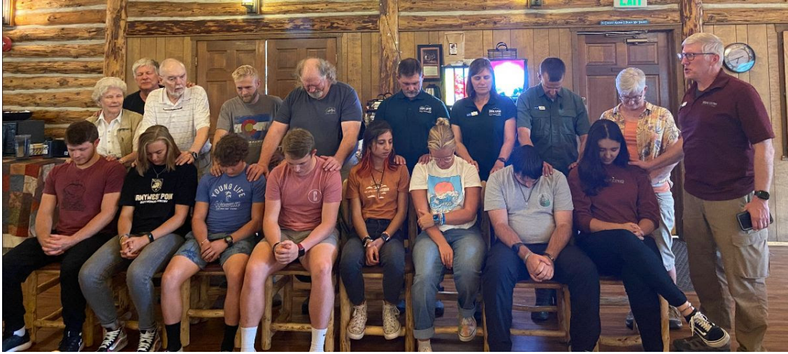
Praying for the interns at their commissioning after their orientation time

Of course there is also time to enjoy the beautiful Rocky Mountains. We took a camping trip to the Great Sand Dunes National Park; some have been hiking and mountain biking; and others are looking forward to the rapidly approaching ski season. We also spent some time outdoors at the shooting range learning fundamentals of self defense.