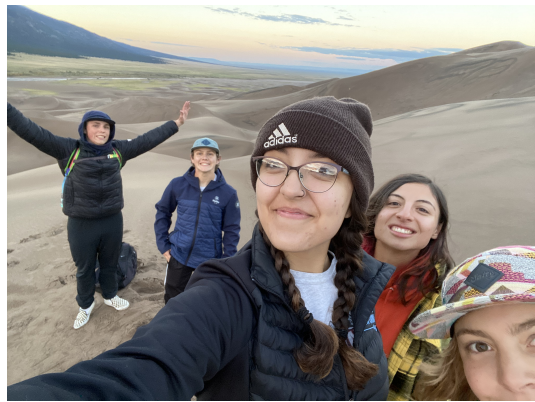
Fun at the Sand Dunes