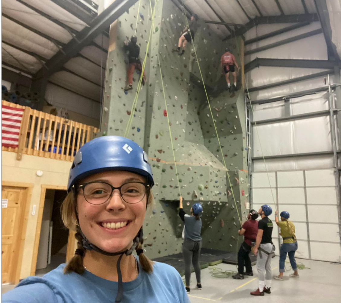
They enjoy many an evening on our climbing wall