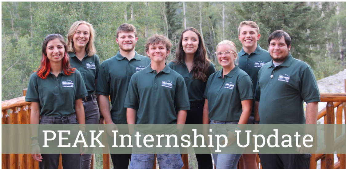
2022/2023 Intern Cohort