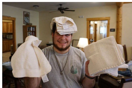
Sheet folding and housekeeping fun