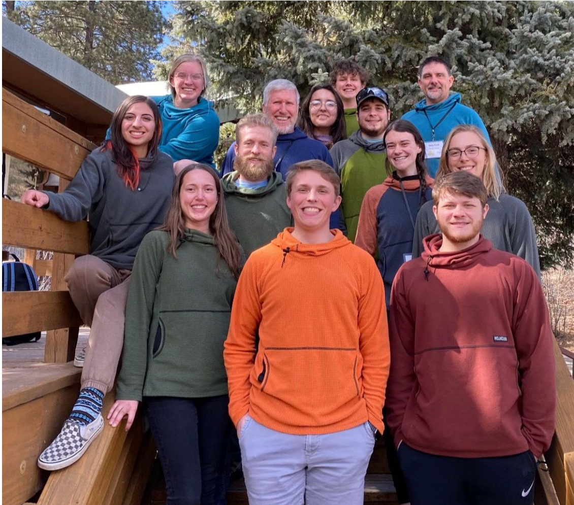
Interns and Staff that attended the CCCA Sectional in Sacramento, NM

Conference Association Sectional meeting in Sacramento, NM in February. The interns saw a bigger picture of camp and conference center ministry and also met interns from other locations to compare notes. We think all came away appreciating the PEAK program!