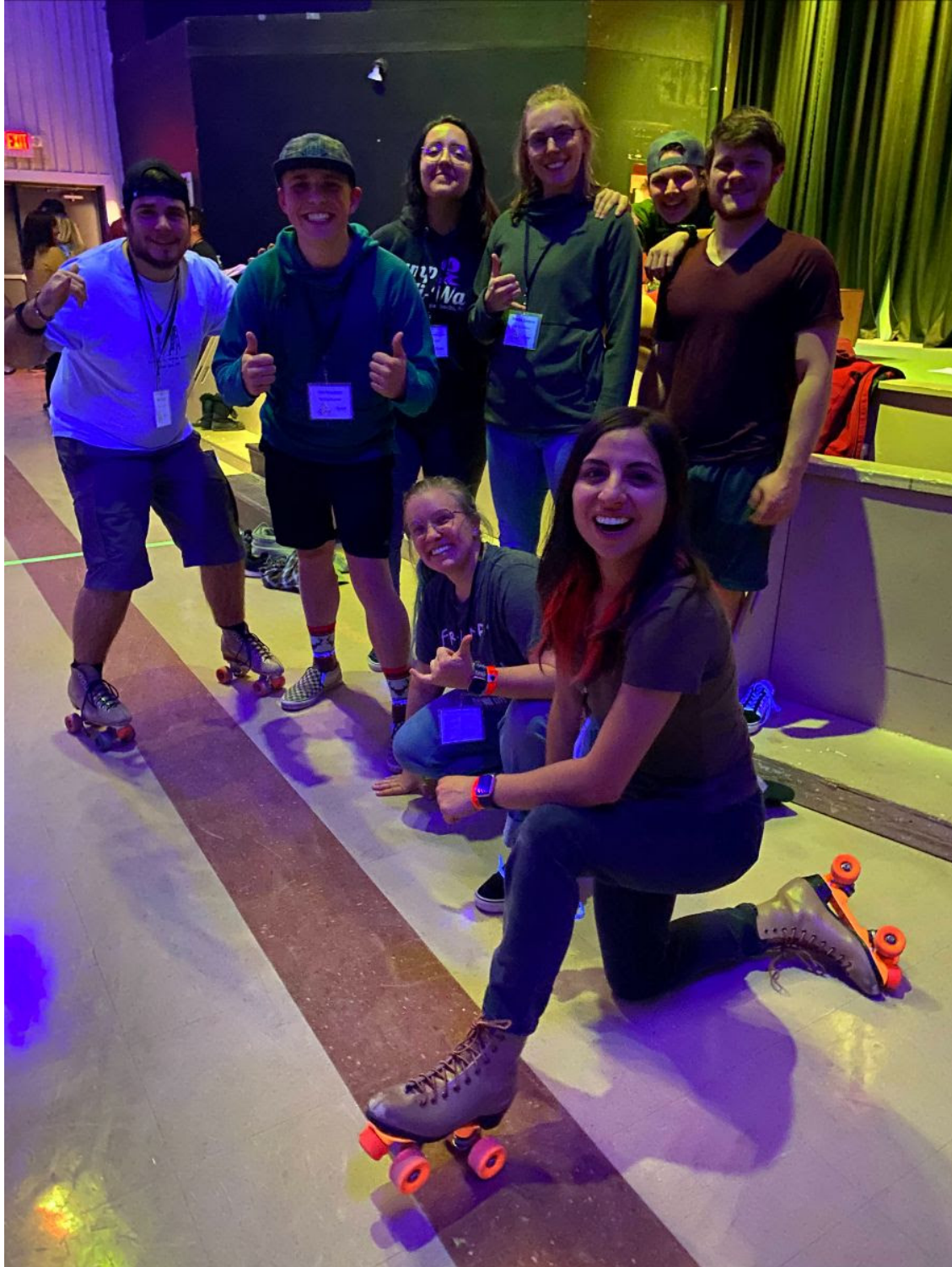
Roller skating at Sacramento Camp

A few weeks ago, the Interns participated in a field trip to Denver which included judging at a speech a debate tournament (this is great for practicing attentiveness and forming quick discernments while providing adequate justification for decisions), and visiting the Denver Art Museum with an assignment concerning the form and content of an art piece of their choosing. On the way back, we made a quick stop at Red Rocks Park and Amphitheatre.