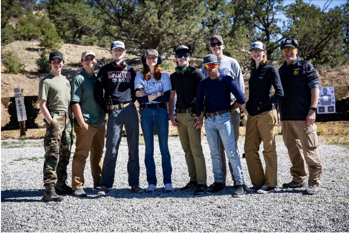
The interns after completing Defensive Shooting led by Col Hawthorne

The interns are working hard as they support our busy retreat schedule, while also gaining leadership skills as they take turns heading up the weekly kitchen and housekeeping crews. They not only lead their fellow interns, but oftentimes they are also supervising our volunteer weekend warriors.