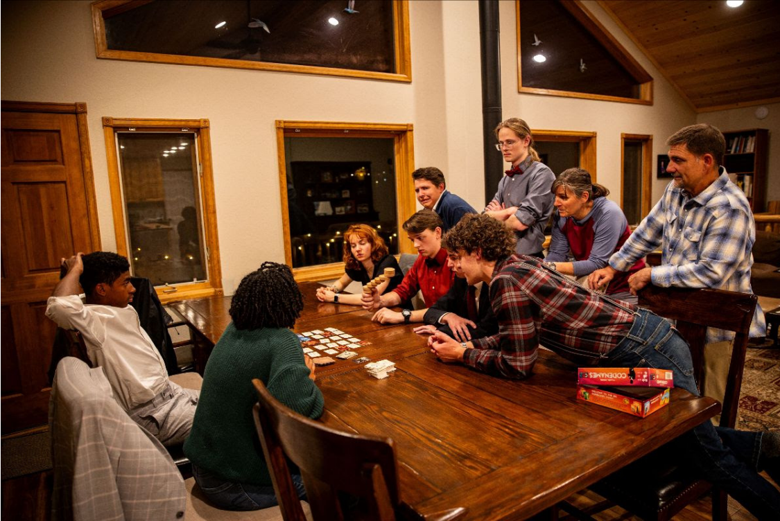
Interns game night at the Truitts'

In the midst of all the service the Interns are also learning some great life lessons in the academic program: