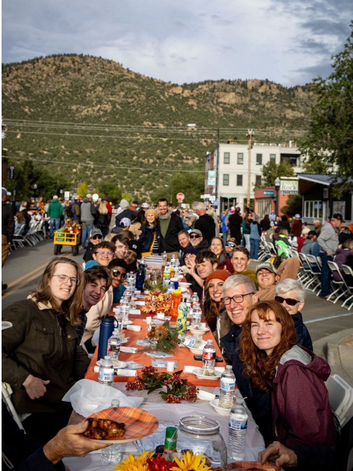
Spring Canyon staff at the annual BV Strong community dinner